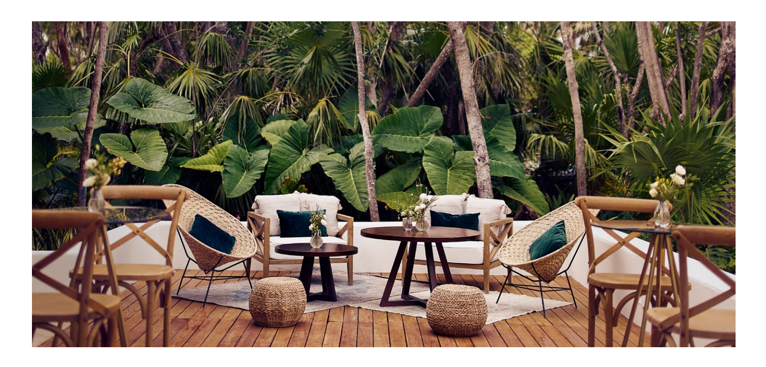
TOTAL FUNCTION SPACE: 58,915 SQ FT